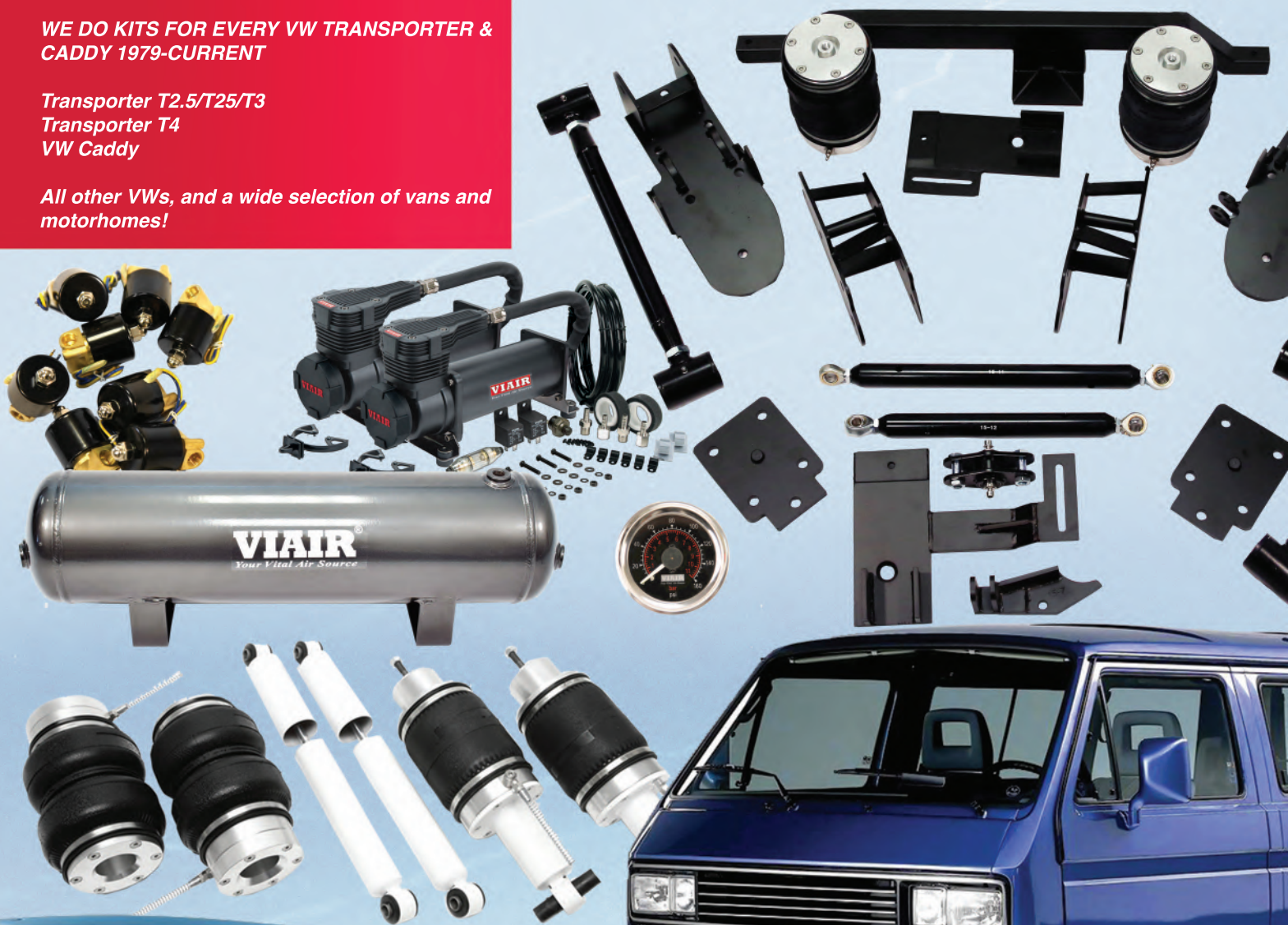
T3 / T2.5 KIT

All other VWs, and a wide selection of vans and motorhomes!